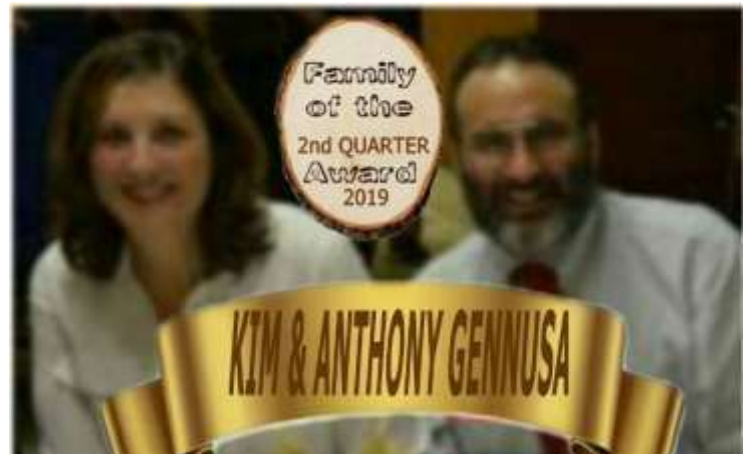
Family of the 2 nd Quarter